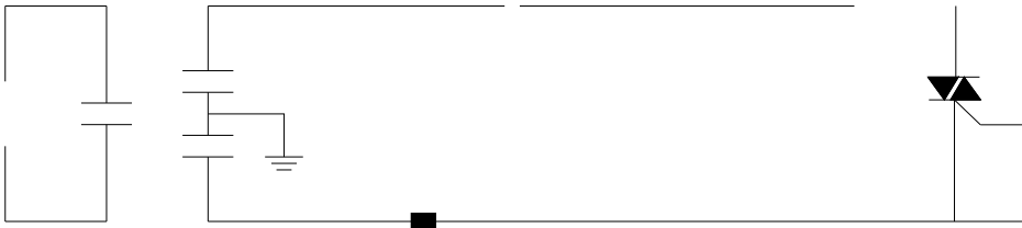
FIG.7 Test circuit for inductive and resistive loads to IEC-61000-4-5 standards